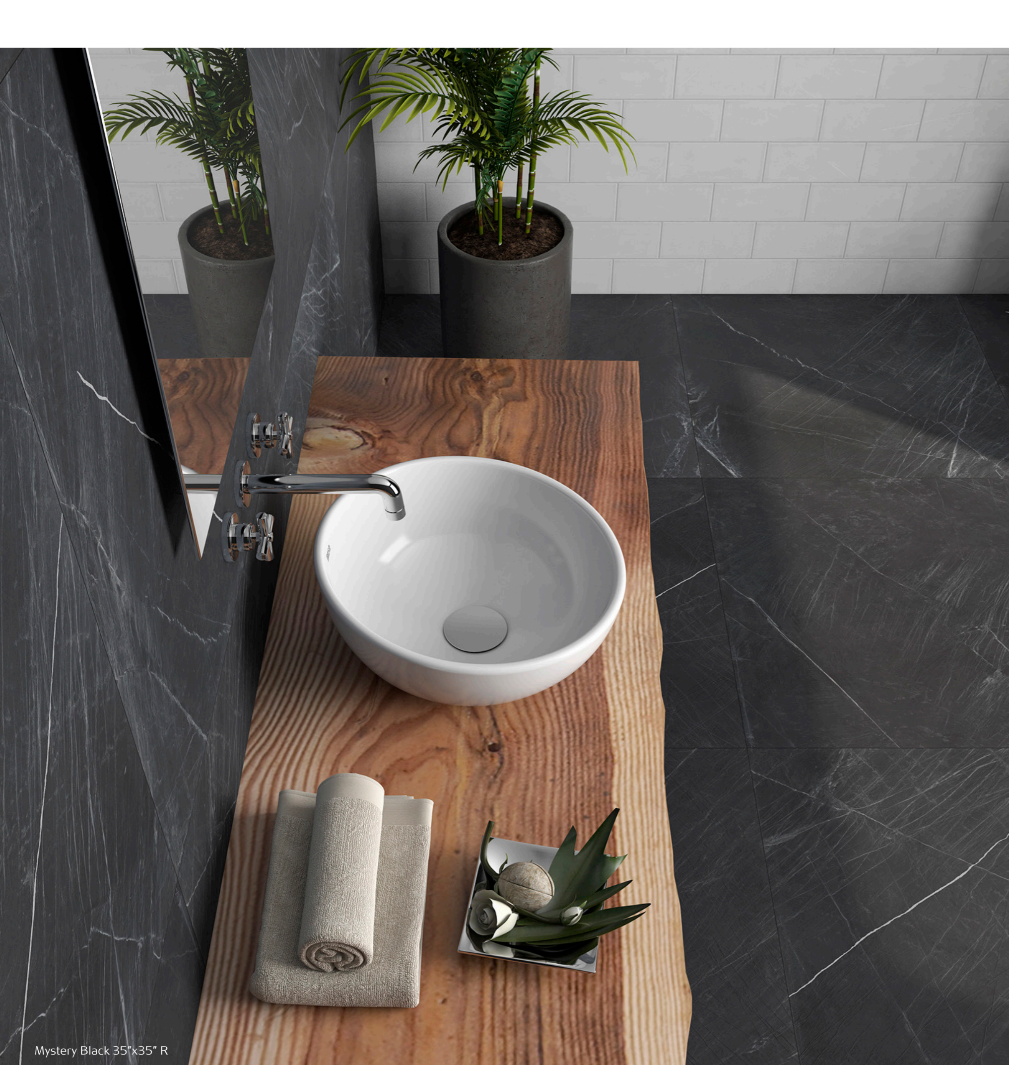
Mystery Black 35"x35" R

A tribute to Marquina marble and to the sober elegance of art deco interiors. Mystery evokes dark stone with delicate white veining to create modern spaces in which style blends with nature.