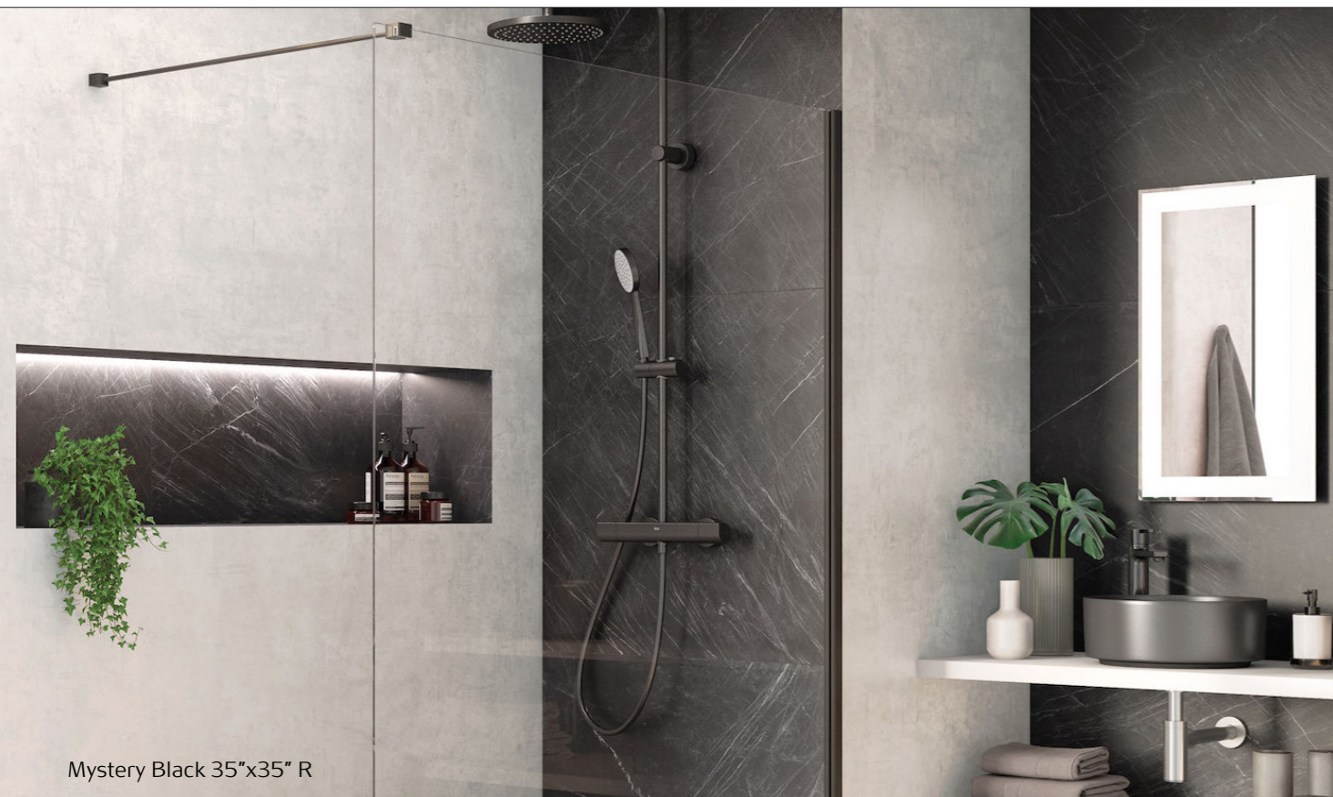
Mystery Black 35"x35" R