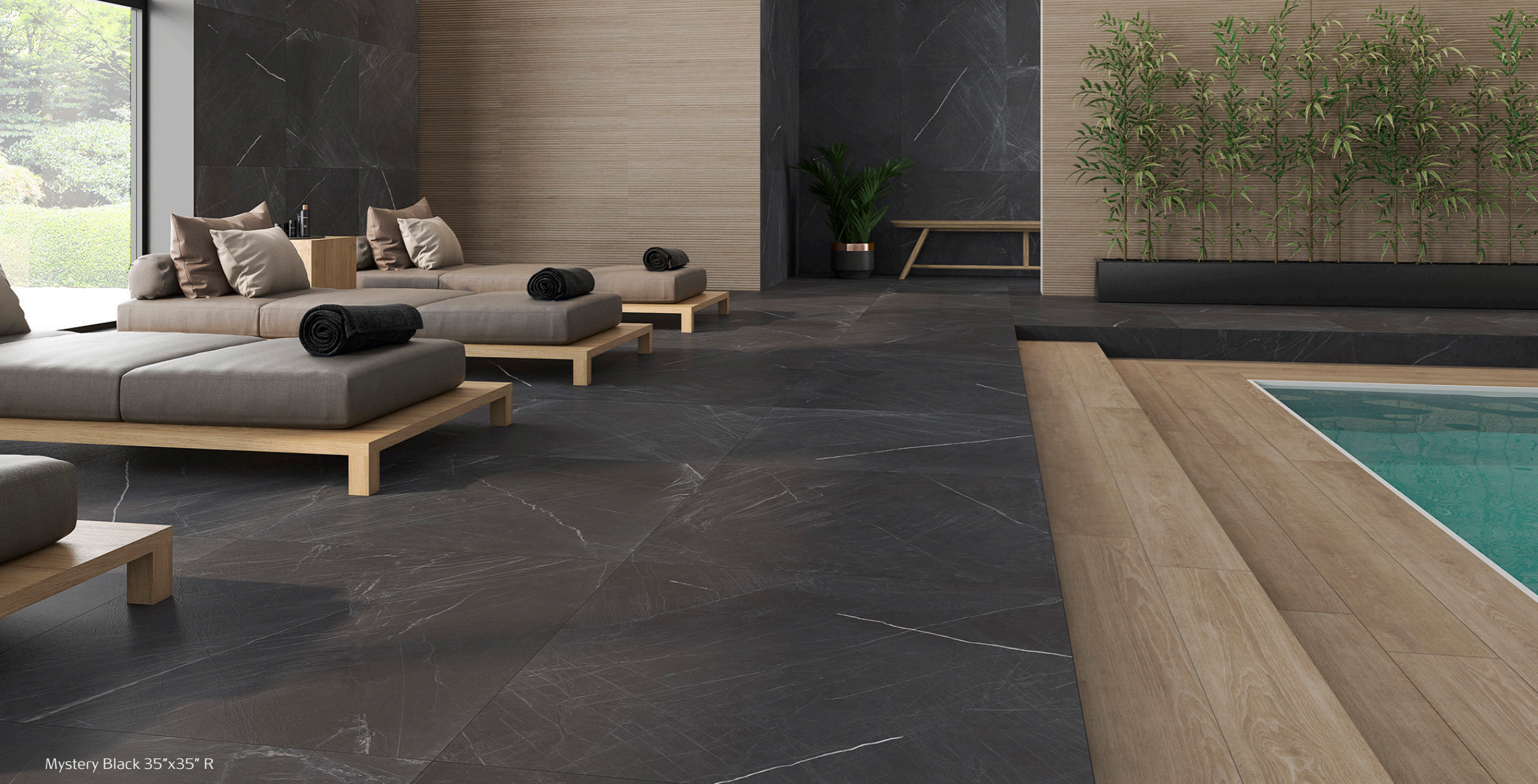
Mystery Black 35"x35" R