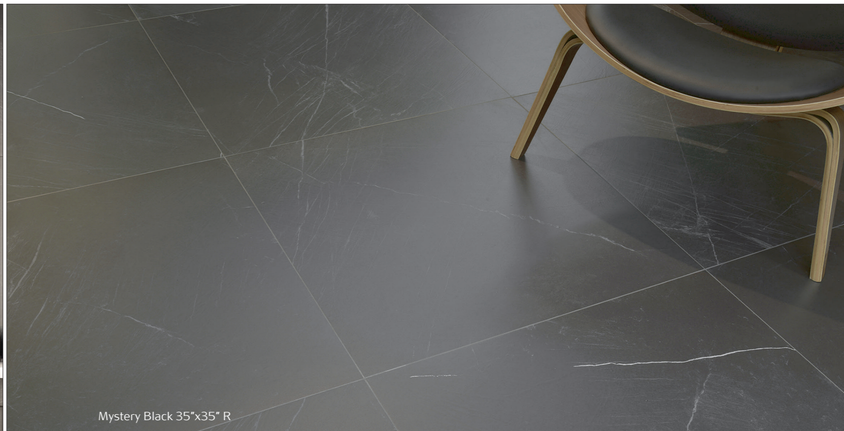
Mystery Black 35"x35" R